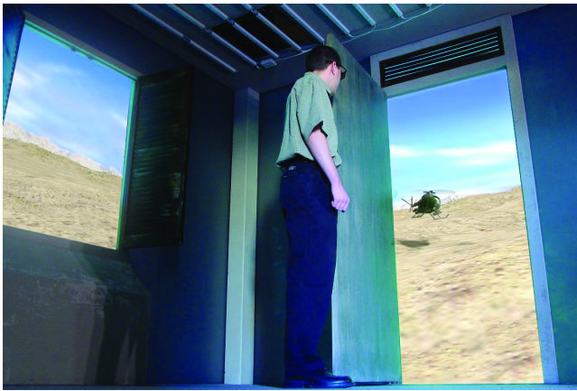
Figure 3: Here, a virtual desert scene projected on two screens is merged with the real room environment's prop window and door-frame. In this setting, a pair of binoculars could be useful for surveying the scene. View magnification on the screen could be triggered when the user picks up a pair of tracked, real binoculars, looks through them, and views the scene presented via the mixed reality 'window'.